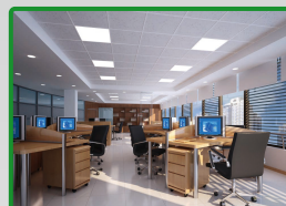
Time Attendance: Office