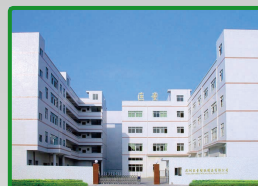
Time Attendance: Factory