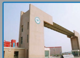
Networked Security: School