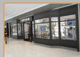
Standalone Access Control: Shop