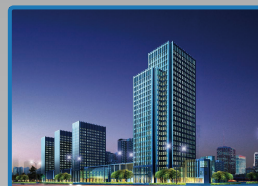
Networked Security: Building